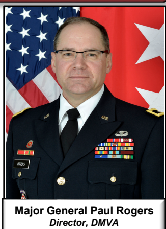
The Adjutant General

Transformation is central for the DMVA, and it involves three elements working in concert to move us forward: Culture , Leadership, and Strategy.